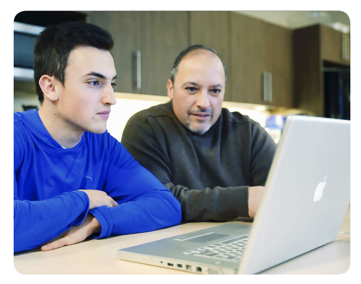
Informed by families