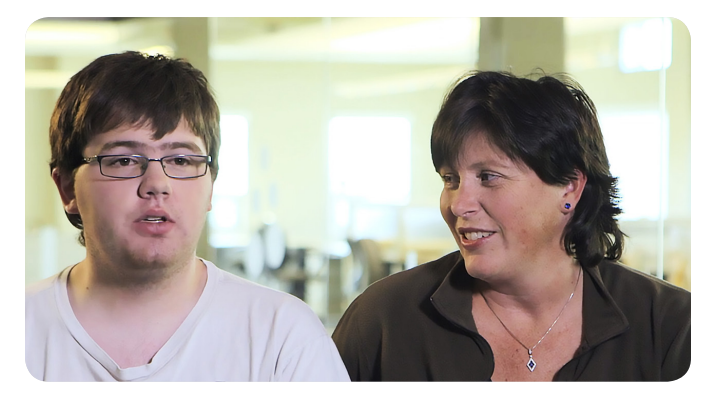
Supporting individuals and their families

British Columbia, Ontario and Manitoba. Sinneave continues to expand the reach by providing workshop training, freely available materials, and support for geography specific changes to the resources section of the workshop guides which are available on our website.